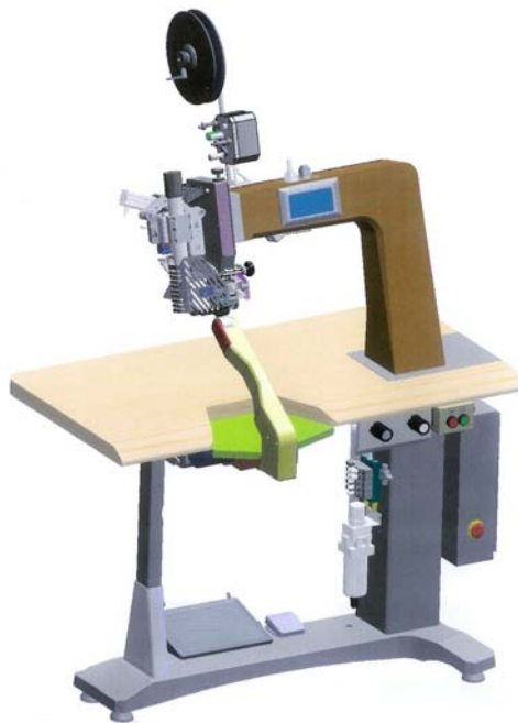
With pedestal for sleeves