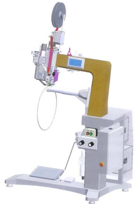
With side arm for cylindrical welding